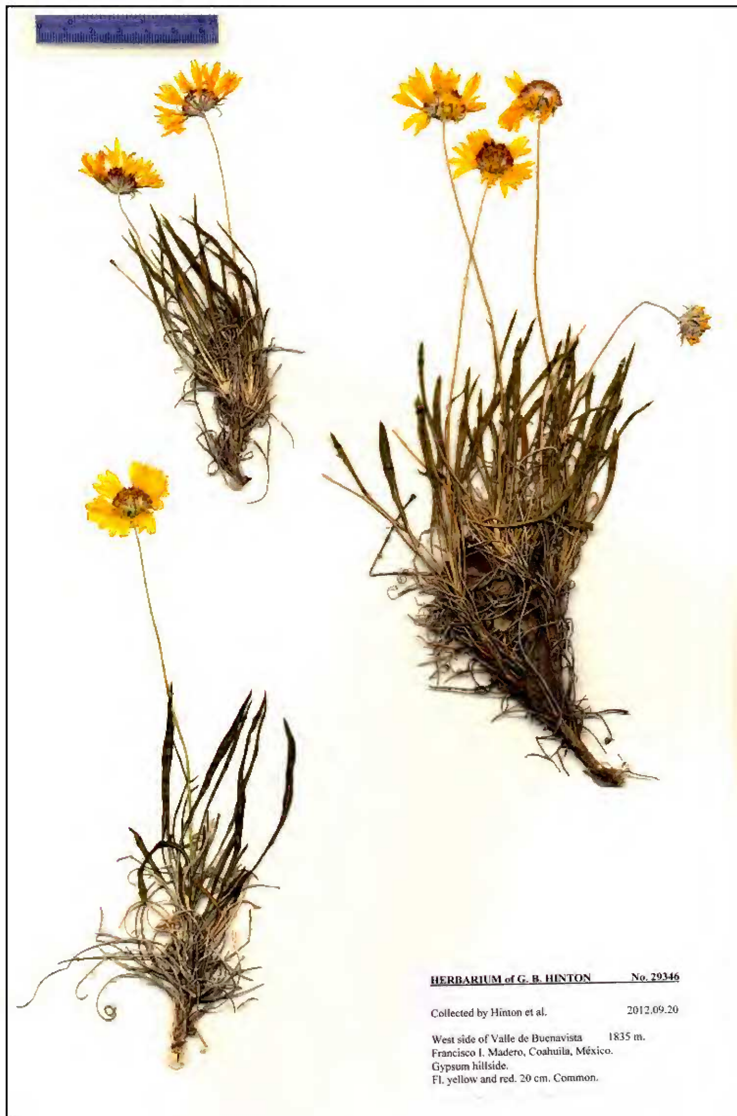
Fig. 1. Gaillardia c. var. mikemoorei (Holotype: MEXU; isotypes: GBH, TEX).